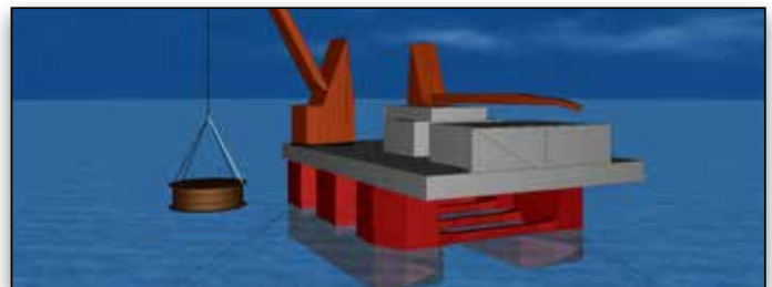
MOSES can compute motions and stability of any vessel or platform.

All three packages include the MOSES Solver and MOSES Language modules – the platform on which all analysis capabilities depend. The unique, generalized solver allows the consideration of all types of forces acting on the floating system, including hydrostatic, hydrodynamic, inertial,